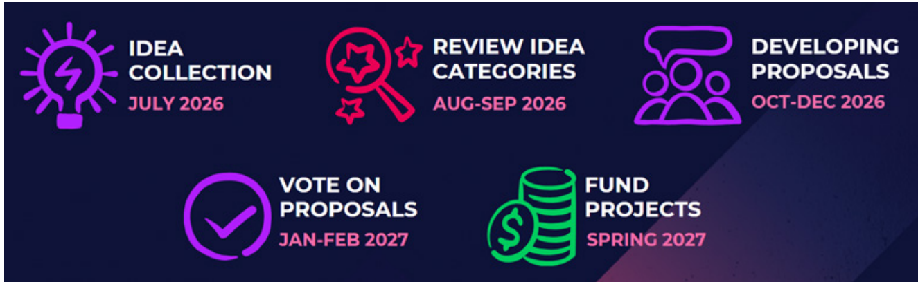
FIGURE 1: PB PROCESS TIMELINE AND DATES

The overall timeline and phases for Participatory Budgeting may change slightly due to process refinements during the year.